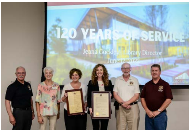
Missouri State legislators present the Library with House and Senate resolutions for 120 year of service

The Joplin Public Library has been providing service to the community since 1902, and on Sunday, June 12, hosted an afternoon open house to provide the community a chance to celebrate and recognize the 120 year milestone. In addition to providing 120 years of service to the community, the Library also celebrated 5 years at their current location on 20th and Connecticut Avenue.