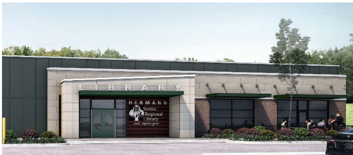
Scenic Regional Library's new Hermann branch

Scenic Regional Library opened the doors of its new Hermann branch on Monday, June 27. The $2.5 million project began in early October 2021 and features a 1000-square-foot public meeting room; two public study rooms; two shaded patios; a café; a shelf-check system; a teen area with an Xbox One for gaming; and a children's area with a 55" touch screen tablet with literacy games, a magnet wall, Lego® table, a Rigamajig and other activities. The opening of this new branch marks the completion of the library's nine-branch, $24 million building project that began in 2017.