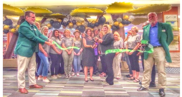
Ceremonial ribbon cutting.