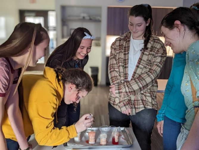
Teens attending an "Escape From Dr. Frankenstein's Monster" escape room at Scenic Regional Library.