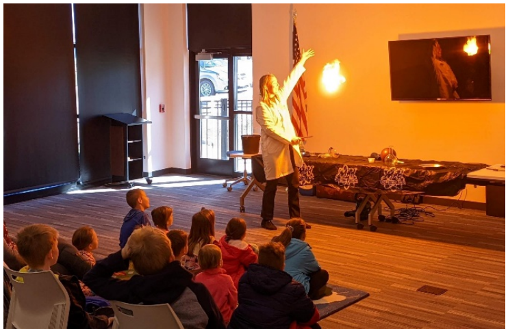
A group of young patrons watching "Mad Science: Fire & Ice" at Scenic Regional Library. This spectacular show included foggy dry ice storms, sizzling, shivering scissors, and bubbly showers!

The Community Read began with a kick-off event at each branch on Saturday, March 12. Starting on Monday, March 21, and continuing through the following six weeks, the Library and its partners presented 104 free programs and book discussions throughout the three-county area (Gasconade, Franklin, and Warren Counties).