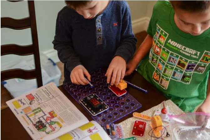
Two children testing out a Curiosity Kit

Thanks to a generous donation from the Lemons Charitable Trust, the library is able to offer three different kit types featuring STEM tools, books, and activities for elementary-aged children. Library card holders ages 7 to 12 and their families can discover electronics and circuit building with Snap Circuits, coding and robots with Ozobots, and electronics and inventions with Makey Makeys.