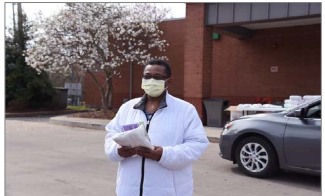
(Above) Diaper and period pack distribution at the Natural Bridge branch. (Below) Diaper distribution at the Natural Bridge branch.