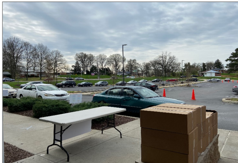
Thirty minutes before opening, the food distribution line at Lewis & Clark is spilling out of the parking lot.