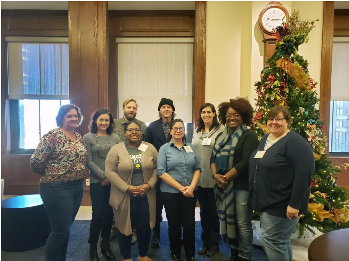
Mizzou students, graduates, and faculty at Library Carpentries workshop