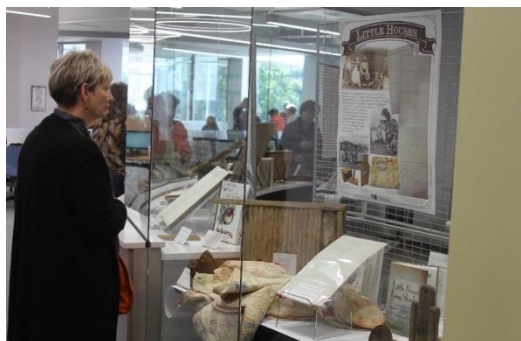
Prairie Fires in Jefferson County exhibit.

Over a thousand participants attended the series of events including the featured author appearances. Online engagement exceeded 12,000 hits, shares, views and comments and included an online guide , a digital exhibit , social media posts, and an eventual spot on CSPAN-3. The combined efforts of the libraries, a local bookseller, Jefferson College Library and Jefferson County Library created the related events to broaden the impact of Ms. Fraser’s visits and to allow for several opportunities to explore important topics addressed in Prairie Fires — American settlement, Native American heritage and displacement, frontier life, the changing ecology and