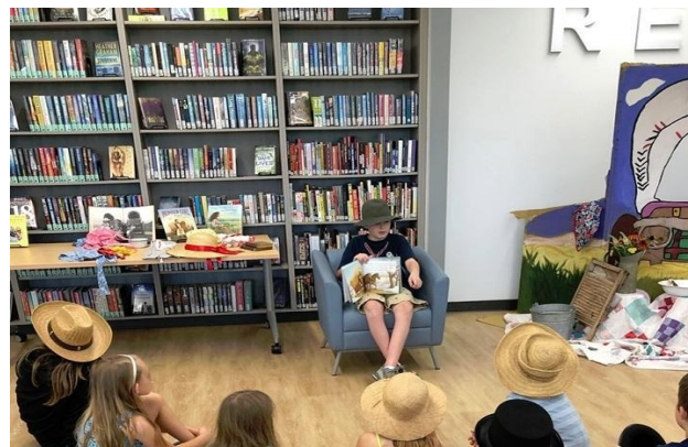
Jefferson College Library. Prairie Days. July 2019.