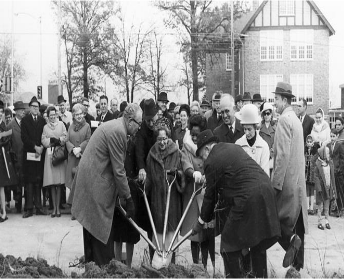
Breaking Ground at CLA

It's an interesting review of the many service and technological changes taking place at libraries. Online visitors can see images of the first bookmobile to serve Mid-Missouri, card catalogs, patrons borrowing artwork from the library, orange furniture, and old cars. To see the collection, visit archive.dbrl.org .