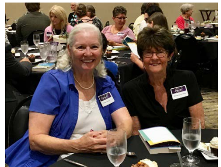
Attendees celebrate MCPL's positive impact on the local community at the 2018 Legacy Luncheon.