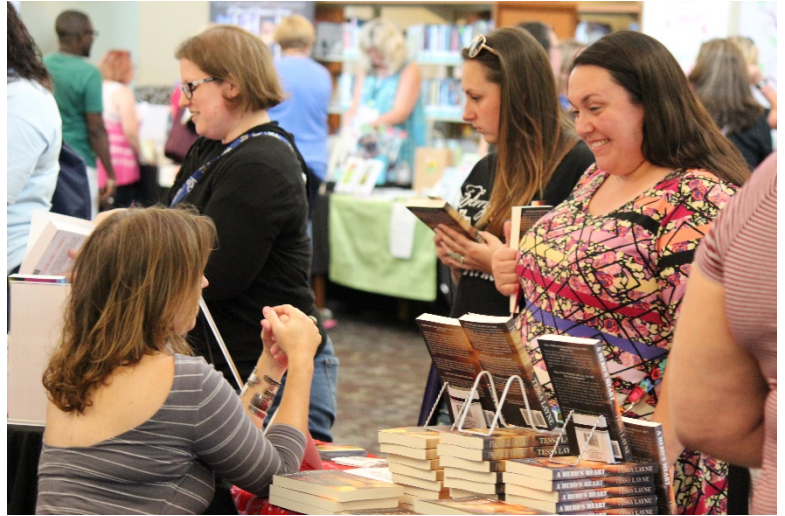
Attendees were able to purchase books and receive autographs from over 35 romance authors during the GenreCon book fair.