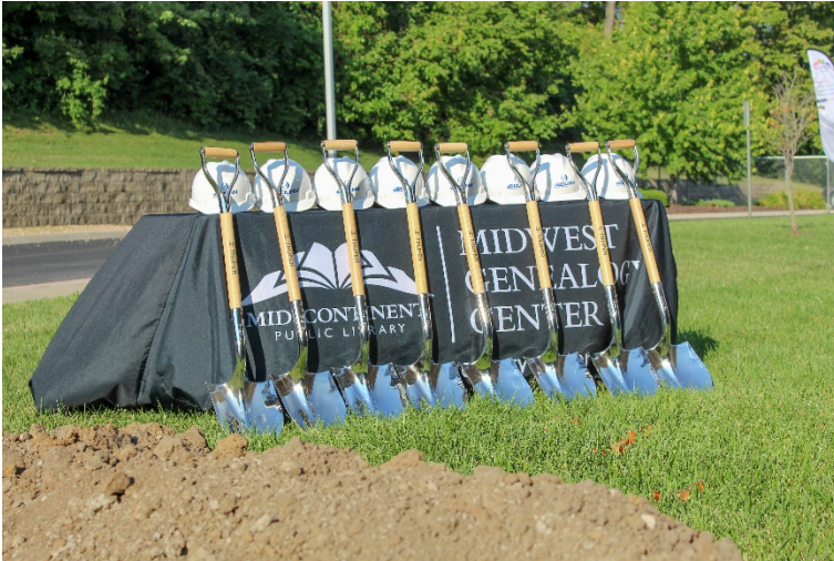
Shovels await the groundbreaking for Midwest Genealogy Center's Community Hall.

On August 2, Mid-Continent Public Library hosted a groundbreaking ceremony for the new addition to its Midwest Genealogy Center in Independence, Missouri. The project, which is scheduled to be complete by late spring of 2019, will include the construction of a new 400-seat community hall with an array of amenities including a foyer, divisible meeting space, state-of-the-art audiovisual capabilities, and an on-site catering kitchen.