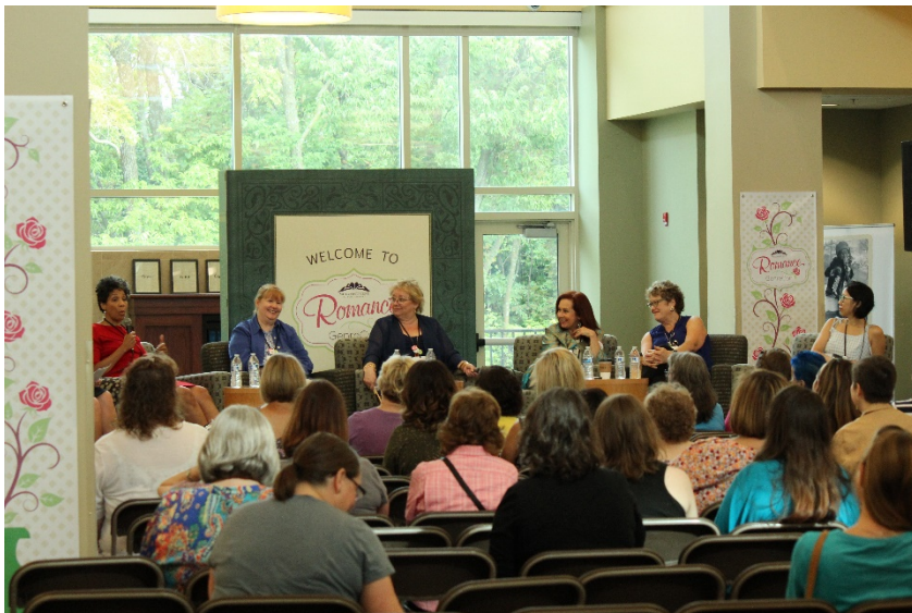
Romance authors sit down to share their experiences during a panel discussion at GenreCon.

In addition to workshops and presentations, Romance GenreCon transformed MCPL’s Woodneath Library Center into an English garden with a costume-optional welcome tea to kick off the event on Friday evening where attendees could meet and greet the authors. During GenreCon, attendees also engaged in a silent auction with donated baskets from the authors and the Library to benefit MCPL’s Story Center ( https://www.mymcpl.org/story-center ).