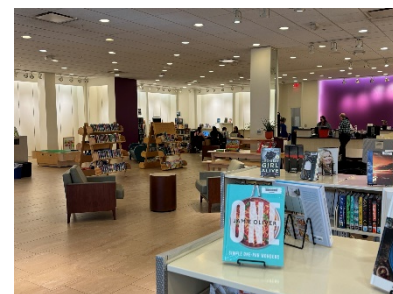
The small browsing collection and other amenities inside the new library branch location