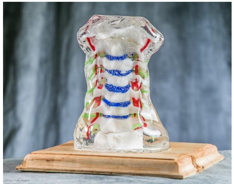
Cervical 3-D Ballistic Gel Model, Patent 11,798,433 B2, October 2023