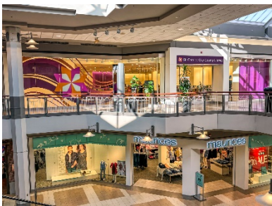
The Mid Rivers Mall Library Branch Location in the Mall

The St. Charles City-County Library announced an official open date for the temporary Mid Rivers Mall Branch. This location, which opened Jan. 22, 2024 provides continuity of library service during the Spencer Road library branch and Middendorf Kredell library branch renovations.