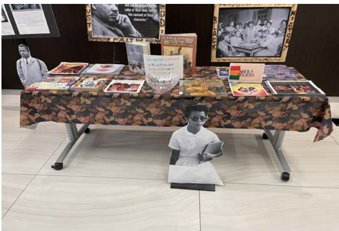
Black History Fair booth