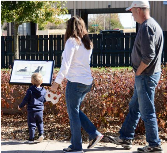
A family enjoys reading the new Storywalk

In November of 2023, the Joplin Public Library celebrated the installation of a permanent Storywalk™ in its outdoor classroom. The installation followed several years of planning and temporary Storywalk projects in the same space, as well as in parks and along walking trails in Joplin.