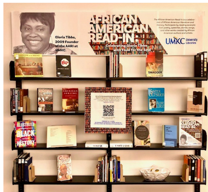
The first floor book display accompanying the 2024 AARI event.