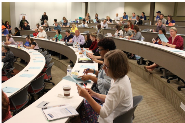
Attendees review handouts during a Small Business Bootcamp event.

Mid-Continent Public Library's Square One Small Business Services division, in partnership with the Northland Regional Chamber of Commerce and the Platte County Economic Development Council, recently offered Kansas City-area entrepreneurs the chance to expand their tech knowledge and network with other local business professionals during their Small Business Bootcamp: Usable Technology on Friday, January 26, from 8:30 a.m. to 12:30 p.m. at the Celebration Station in Zona Rosa.