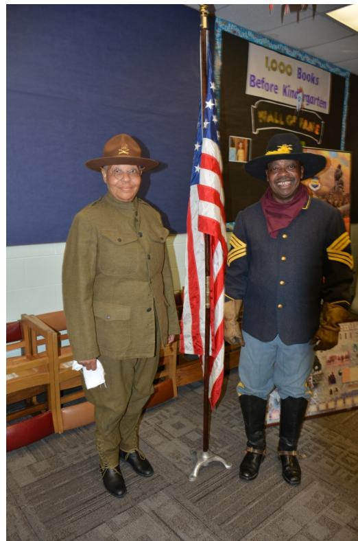
Presenters dressed as Buffalo Soldiers from different time periods as they educated patrons on the history of these African American heroes.

This year, the Library also added two new programs to its lineup of Black History Month offerings—both centered on renowned scientist and humanitarian George Washington Carver. Park Rangers from the George Washington Carver