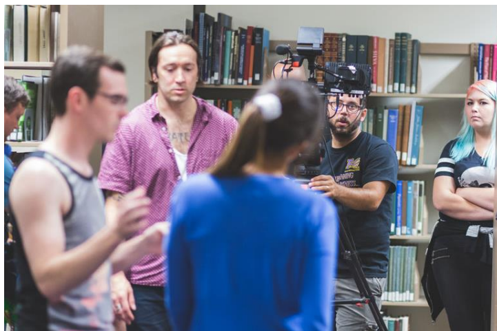
The library steals the scene

The library has thus far declined requests to be interviewed and to sign autographs, but it does offer a date stamp to fans.