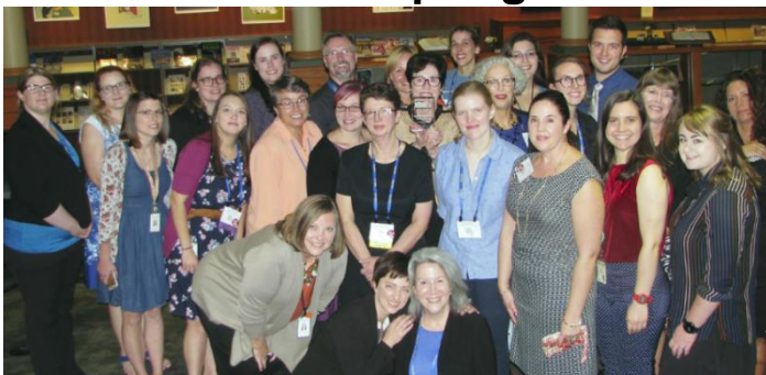
Springfield-Greene librarians and Springfield Public Schools librarians at September's School Library Reception.