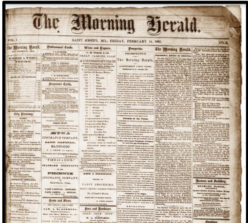
The St. Joseph Morning Herald front page from February 14, 1862. The daily paper provided the northwest Missouri town with a connection to the large metropolitan regions in the east by covering local, national, and international news.

The grant will provide funding to digitize Buchanan, Gentry, and Shelby County newspapers from 1868-1975, preserving the essential records of local politics, issues, events and people. In addition to holding valuable information for genealogists, the papers also provide an important perspective on national concerns such as the development of the American West, Reconstruction and Western legends such as Jesse James.