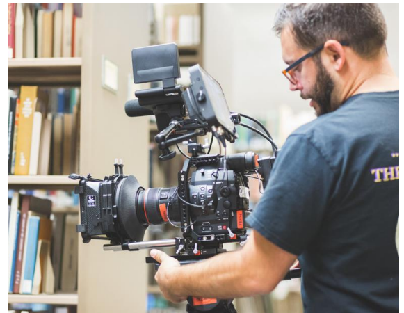
All right, Mr. DeMille, I'm ready for my close-up

Cast and crew arrived on Friday, Sept. 16, after the library closed for 11 hours of filming. They returned again on the night of Friday, Oct. 7, for a few hours to reshoot some of the scenes in the stacks on the lower level and at a service desk on the first floor. Fortunately, the reshooting was completed before the service desk is slated to be removed in an ongoing remodel of the library. For photos of the library's star turn, check out the film's website , particularly the cast and crew sections. The film also has Facebook and Instagram pages with some photos of the library. In addition to Springfield, other filming locations included Billings, Fair Grove, Nixa, Rogersville, and Sparta (Holman, 2016).