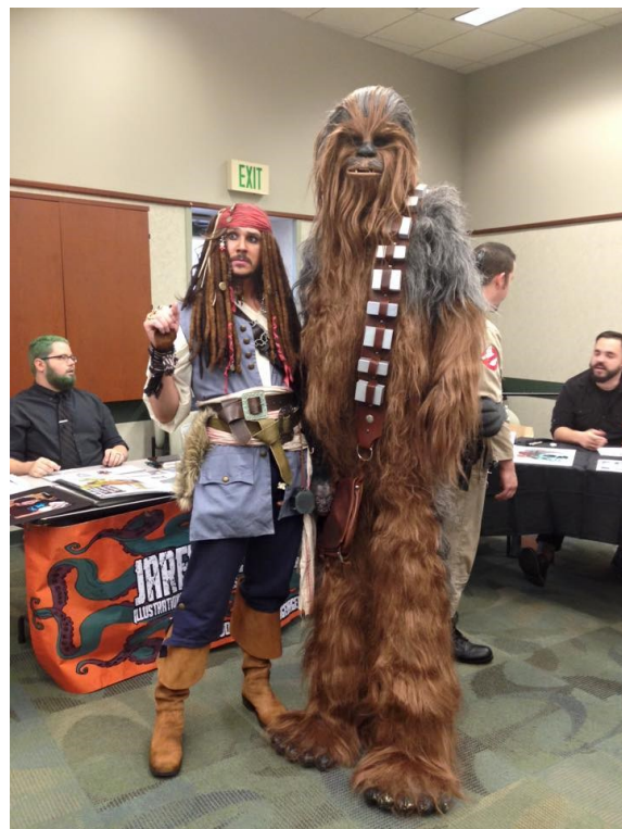
Jack Sparrow and Chewbacca Cosplay