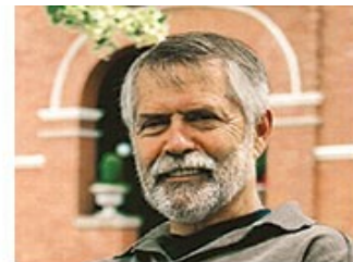
Young adult authors Ellen Hopkins and Chris Crutcher