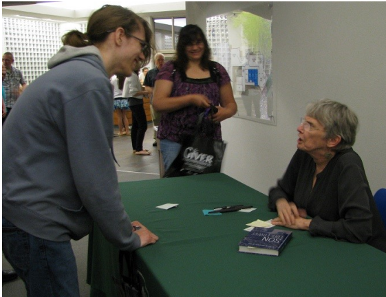
Lois Lowry at the book signing after her April 2 talk for One Read.