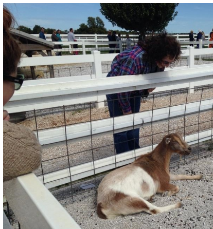
You can't get a librarian's goat! (goat)

Later we went out on our first dinner and a movie, The Fault in Our Stars , in a quest to "research" the perennial question—which was better: the book or the movie?