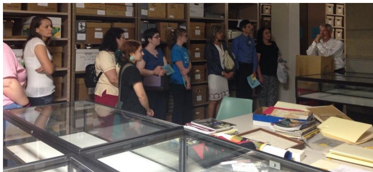
Too much of a good thing is never enough! (shelving in archives)

MSU, we saw the oldest book in the library (1502), as well as The Historie of Foure-Footed Beastes , which has inspired a Facebook page. A 1930 yearbook picturing first graders at MSU's laboratory school using saws while working on a school project showed how much times have changed. We also viewed an exhibit of Mesoamerican and Native American art which was the product of a collaborative effort between Special Collections and an art history professor.