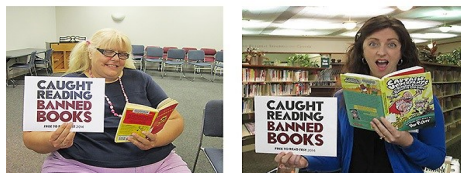
Faces from Free to Read Fest