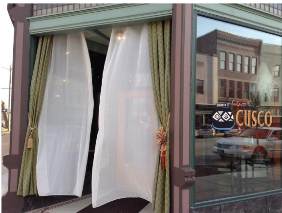
Passage to paradise at Café Cusco (curtained doorway)