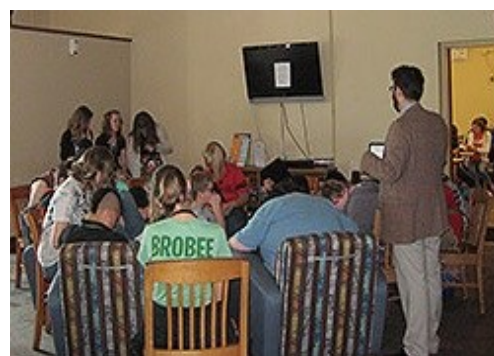
A crowd from We're Pulling the Plug!

Thirty-two teens participated in the We're Pulling the Plug! teen program on September 25 at the Midtown Carnegie Branch Library. Instead of pitching a fit that they couldn't play Xbox or get on the computers, several kids asked to play Mafia, a progressive story game, and enjoyed an unplugged day of play in the library.