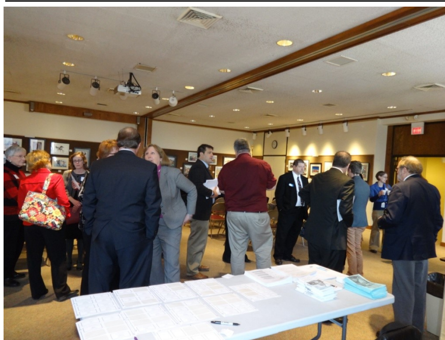
Attendees mingle at Legislative Advocacy Day.