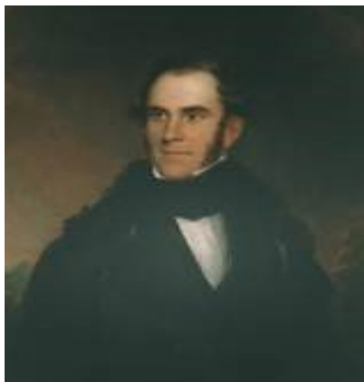
Asher B. Durand. Portrait of Thomas Cole , 1838, oil on canvas

For more information about the exhibit and programs, call the RHCL Belt Branch at 816-232-5479 or visit the library's website, www.rhcl.org .