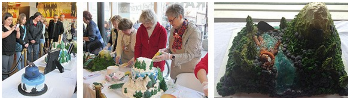
Participants are served at the Edible Books Festival at Park Central Branch Library

The month kicked off with the annual Edible Books Festival at the Park Central Branch Library. Area professional bakers baked and decorated cakes using the book's character, theme or a scene, in the case of the first-place winner. After the judging, everyone who dropped by the library that night got to eat the cakes. Before the public Big Read began, the Big Read Committee held kick-off parties for staff across the district, serving "puppy chow" and giving out Big Read "Answer the Call" buttons and T-shirts, bookmarks and giant calendars to keep track of the month's activities. Staff also had their own Flash Fiction and Call of the Wild Photo Contest while the public contests went on. The Big Read was funded by the National Endowment for the Arts in partnership with Arts Midwest, the Friends of the Library and The Library Foundation.