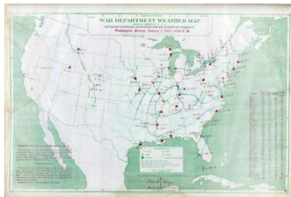
War Department Weather Map, January 1, 1872. U.S. Daily Weather Maps, NOAA.

Missouri and surrounding states have lately seen a lot of extreme weather, and many folks comment on how much worse the weather seems to be getting. But how do we know? A few online resources are available to help compare these present-day weather patterns with historical ones.