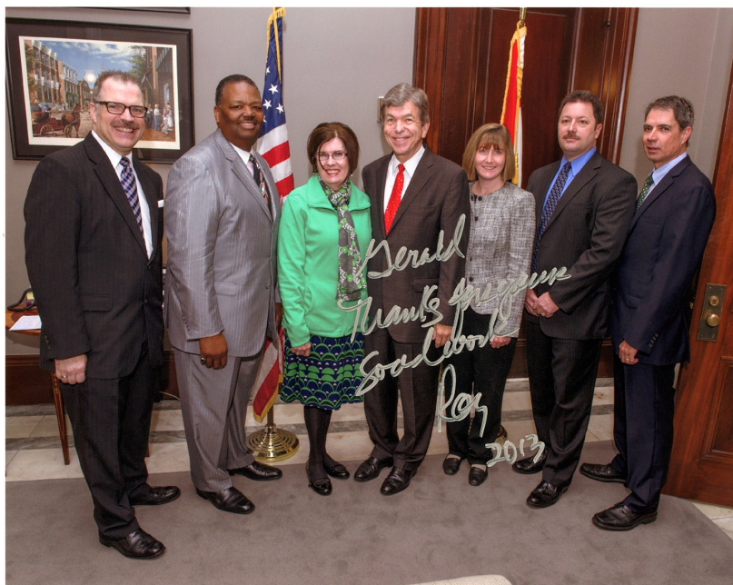
Members of the delegation meet with Senator Roy Blunt.