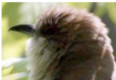
Black-billed Cuckoo.

Springtime is here, and you're probably seeing more wildlife now than you did in winter. But what if you heard an animal without seeing it; would you recognize it?