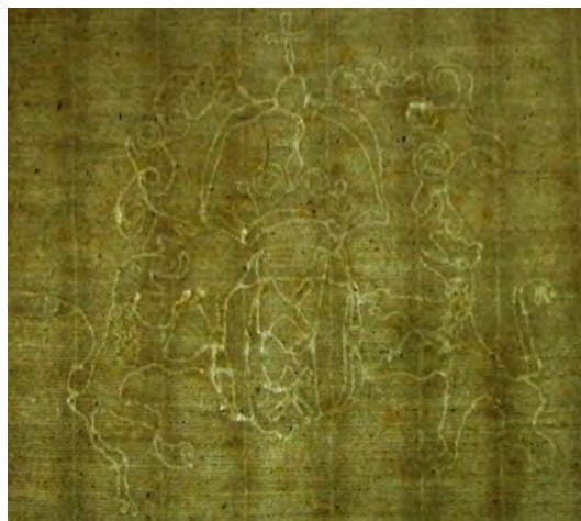
Watermark from book printed in 1607. Captured using a light table and digital camera, adjusted in Adobe Photoshop CS5. Missouri State University.

If the watermark is still difficult to see once the item is digitized, try manipulating the image using image-editing software. (For examples of free editors, see the "Digital News: Let's Get Digital" column in the May 2011 issue of MO Info .) Each image will be different depending on the type of paper, whether the paper has anything printed on it, what color(s) the paper and ink are, etc., so not every method will work on every image; some steps to try include increasing the contrast, inverting the colors of the entire image, or converting the image to grayscale. Also, if the watermark is small, be sure to do a high-resolution scan or photograph in order to see the watermark's details better.