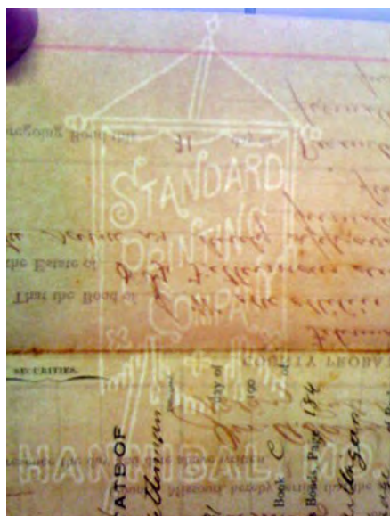
Watermark behind print on paper, logo for the Standard Printing Company of Hannibal, Missouri, c. 1900. Captured using natural light and a digital camera.

With a scanner or digital camera, the process of digitizing a document is relatively simple. But what about a document with a watermark? If you have access to a flatbed scanner that can scan negatives or photographic slides (in other words, a scanner with a backlight), you're set. However, if you don't, here are a few strategies for making a watermark visible in the digital version: