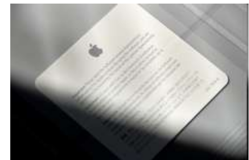
Mac License Sticker Click for attribution & license